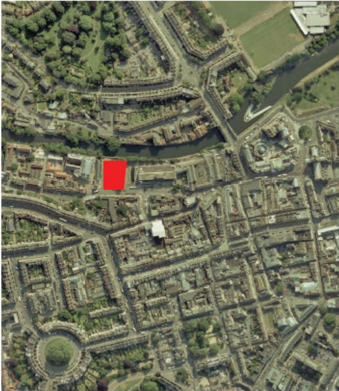
Proposed Casino Location